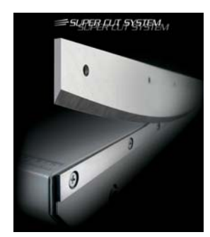
SUPER CUT SYSTEM Carbon hardened steel blades and counter-blades with 65° sharpening for long-lasting cutting operations